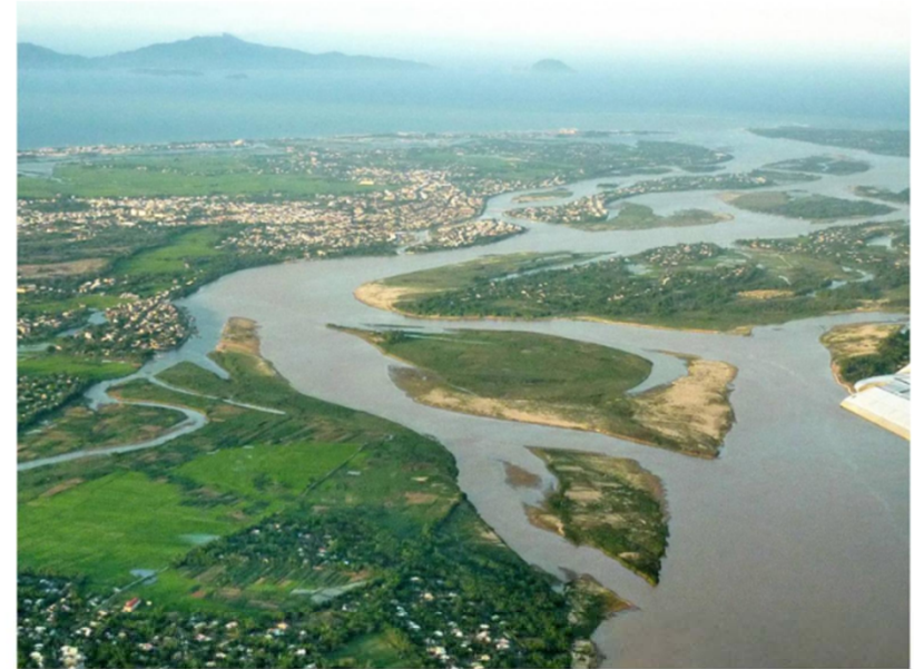
Aerial view of Cham Islands and Hoi An.

Cham Islands Marine Protected Area Authority